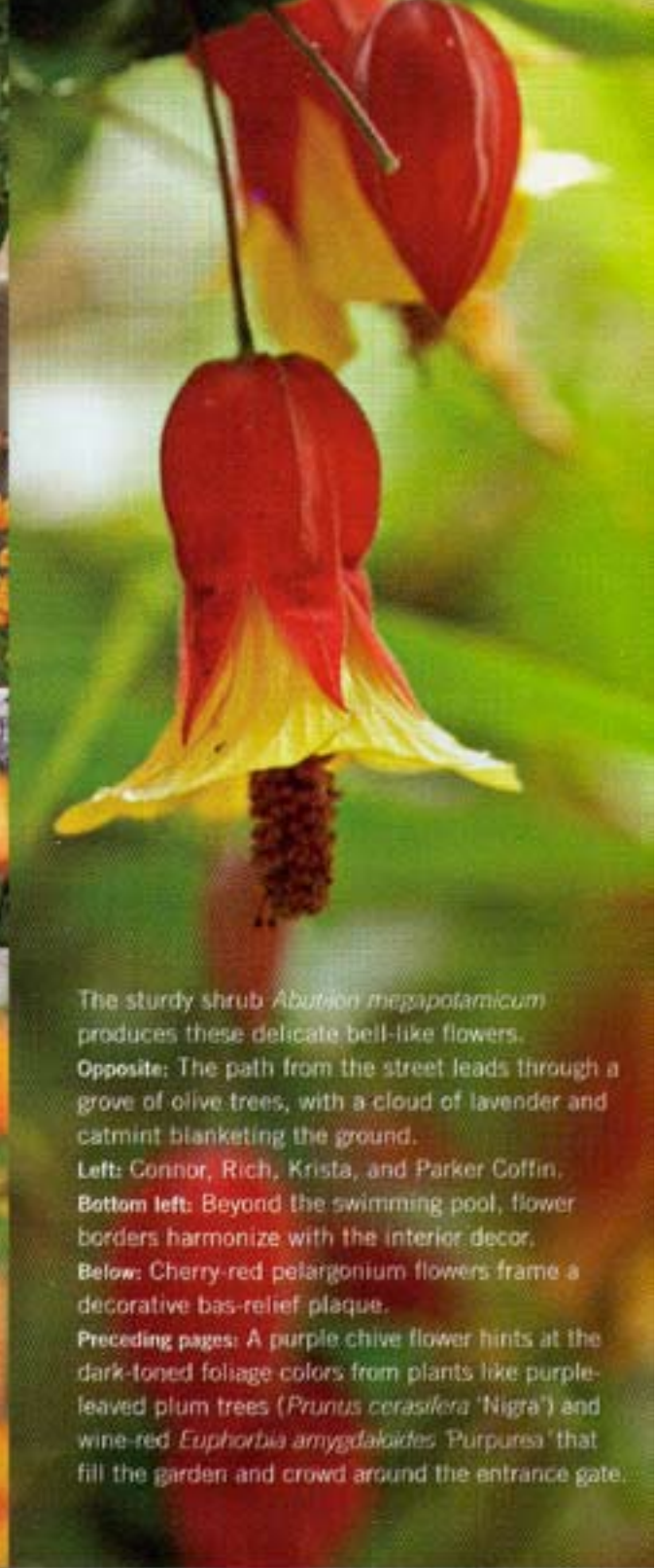
The sturdy shrub Abutilon megapotamicum produces these delicate bell-like flowers. Opposite: The path from the street leads through a grove of olive trees, with a cloud of lavender and catmint blanketing the ground. Left: Connor, Rich, Krista, and Parker Coffin. Bottom left: Beyond the swimming pool, flower borders harmonize with the interior decor. Below: Cherry-red pelargonium flowers frame a decorative bas-relief plaque. Preceding pages: A purple chive flower hints at the dark-toned foliage colors from plants like purple-leaved plum trees ( Prunus cerasifera 'Nigra') and wine-red Euphorbia amygdaloides 'Purpurea' that fill the garden and crowd around the entrance gate.