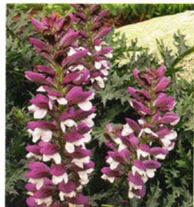
Garden detail Statuesque acanthus stands out with its height, deep color, and complex texture.