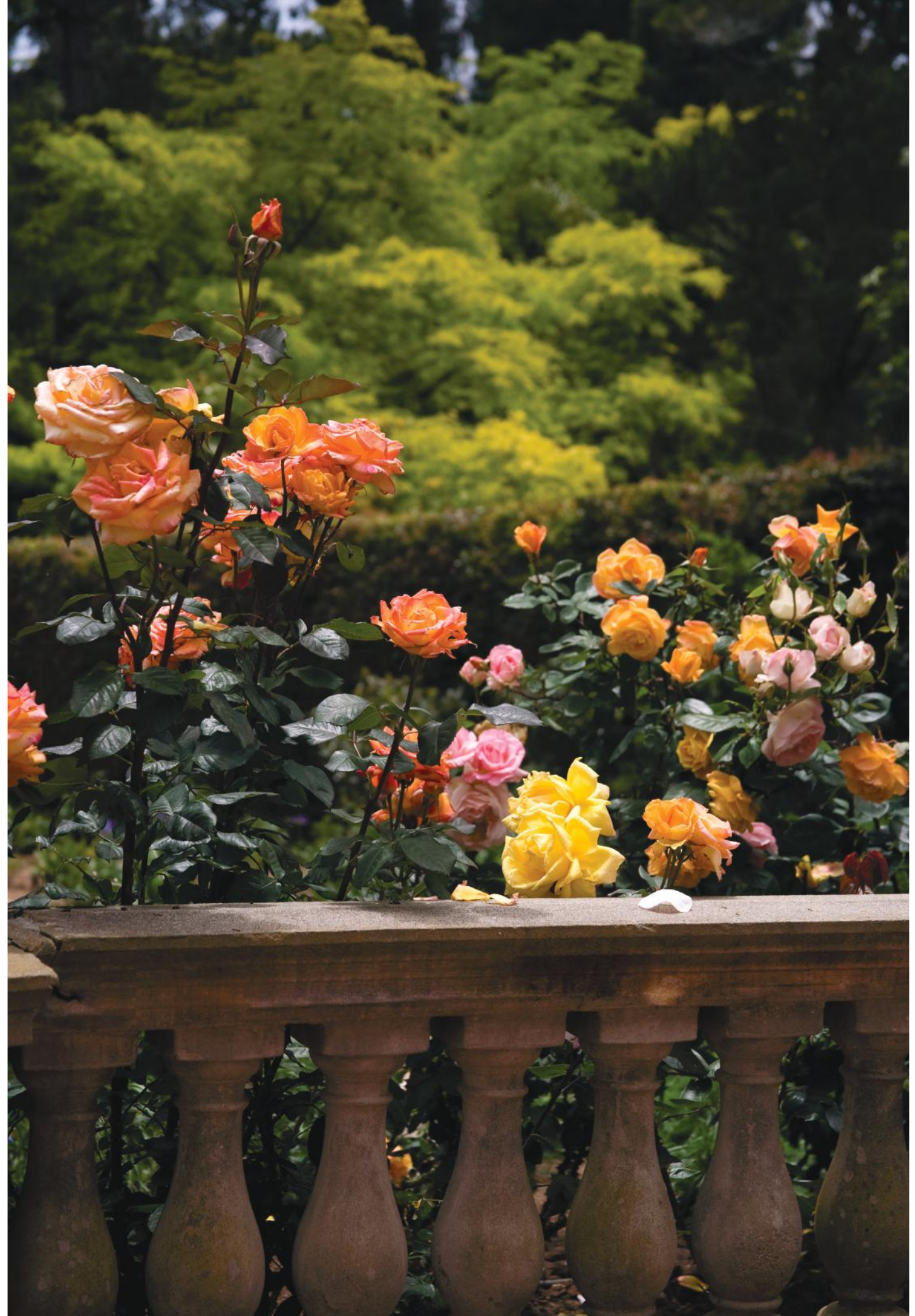
LEFT Beautiful roses add exuberance to the garden.