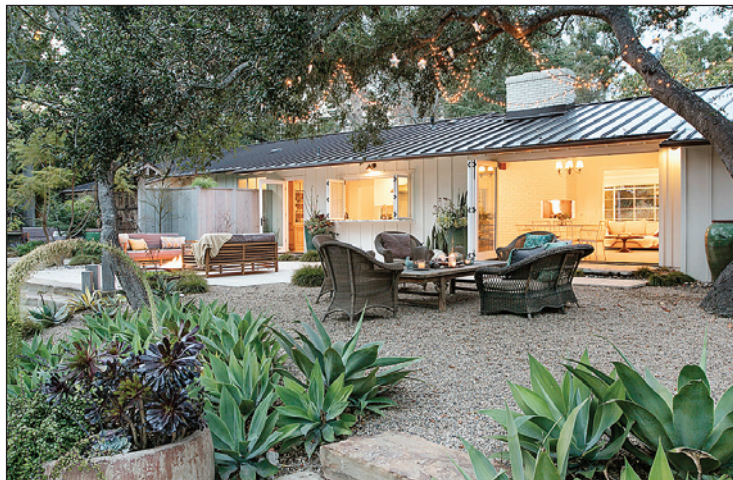
The backyard of the home has been re-landscaped to bring the outdoors in